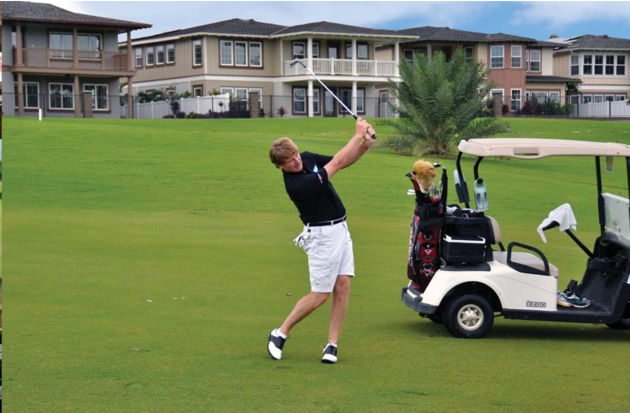
Ernie Els checked out his signature design at Hoakalei Country Club in January. He also met with club staff and members during his two tours of the course..

In between the Hyundai Tournament of Champions and the start of the Sony Open, Ernie Els came to 'Ewa Beach to play his signature design at Hoakalei Country Club. During his first visit to the course in 2011, he played a few holes and discussed additional enhancements he'd like to make to his award-winning design.