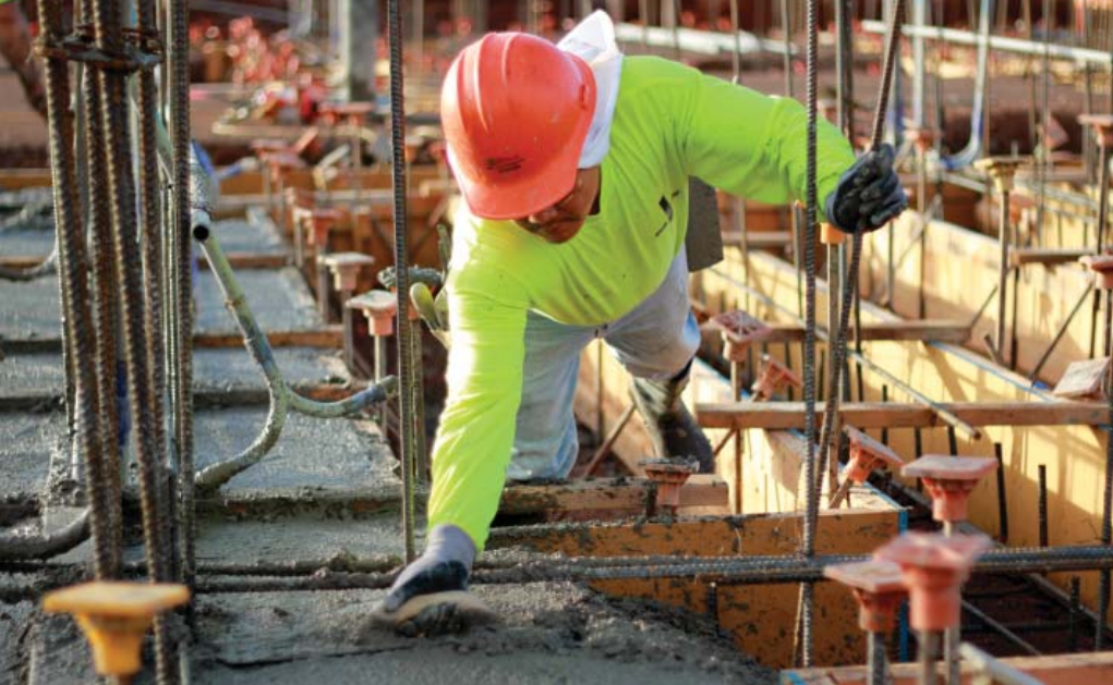
Workers began laying the foundation for the new UH West O'ahu campus in December