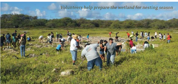
Volunteers help prepare the wetland for nesting season

Thanks to volunteers from the 'Ewa-Pu'uloa Hawaiian Civic Club, Pu'uloa Outrigger Canoe Club, Boys & Girls Club of Hawai'i Hale Pono 'Ewa Beach Clubhouse, Haseko and the Hoakalei Cultural Foundation for giving their time.