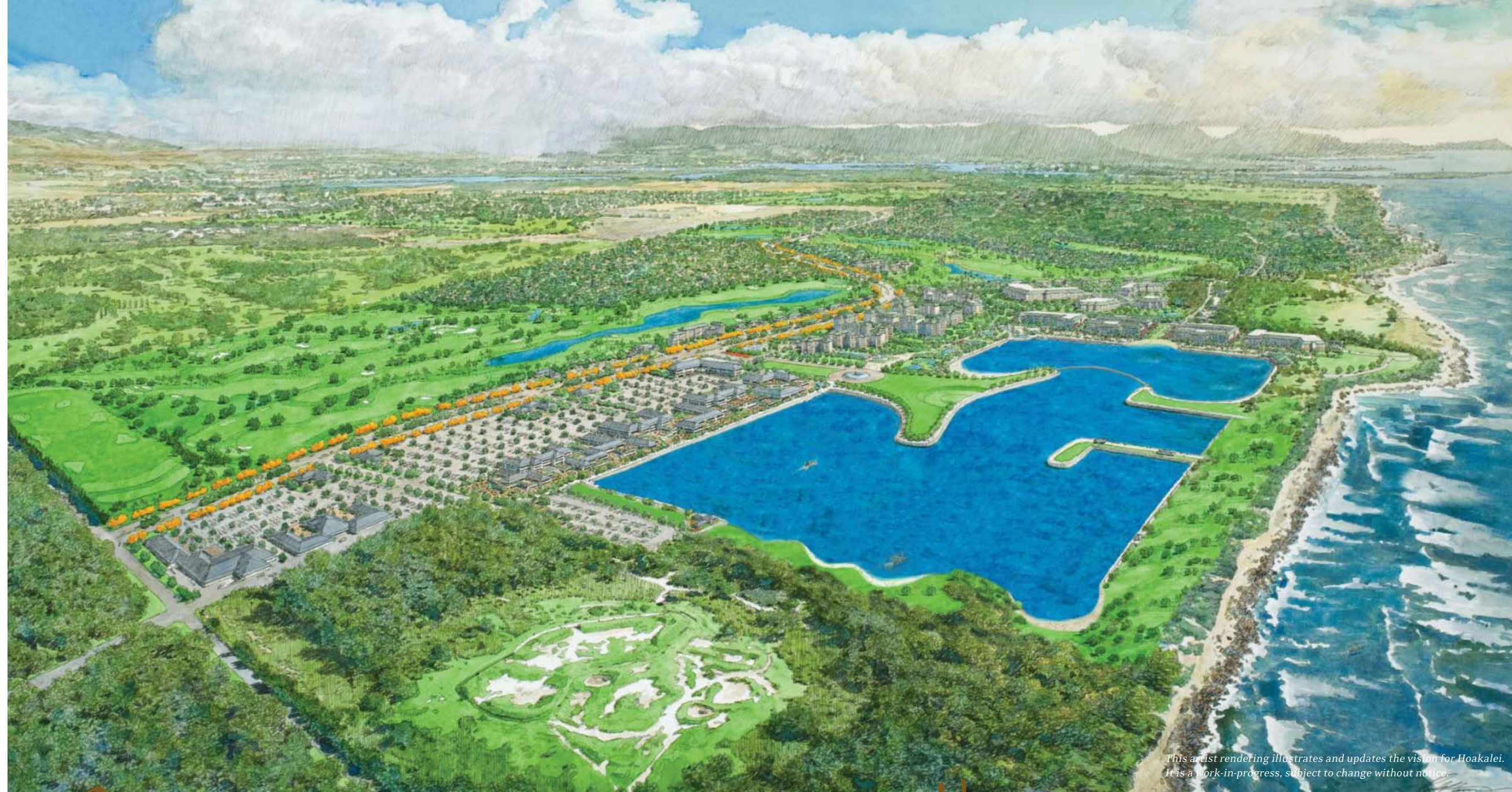
This artist rendering illustrates and updates the vision for Hoakalei. It is a work-in-progress, subject to change without notice.