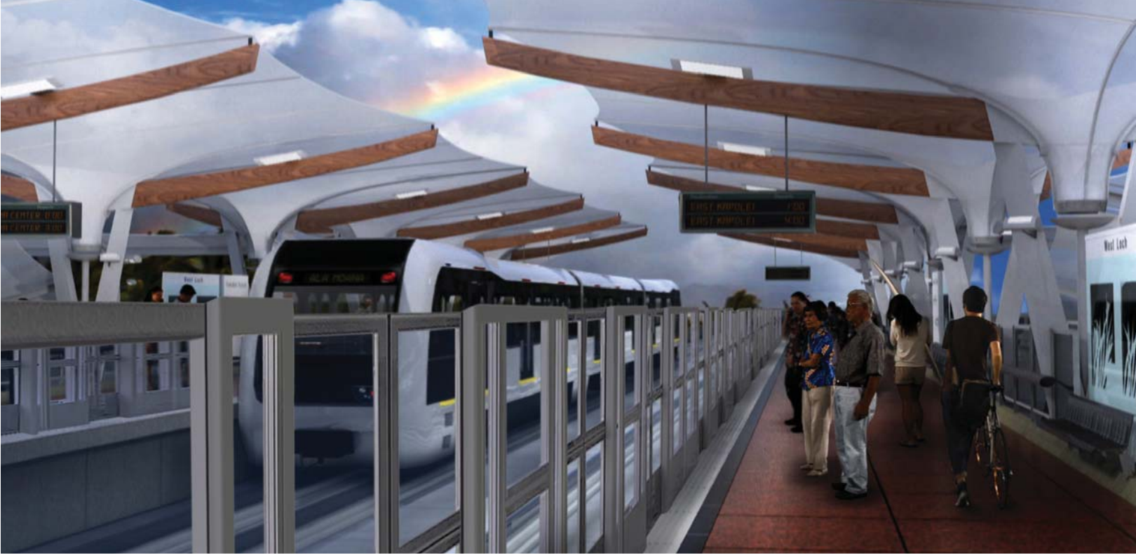
The Federal Transit Administration gave approval to the City to start construction on the first phase of the project

The school hopes to add additional international gardens throughout the campus in the years to come.