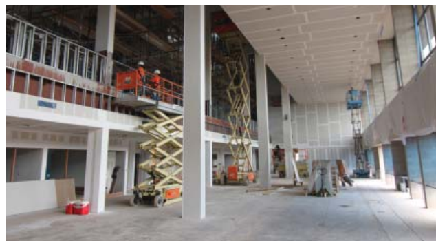
shot of campus construction and for more information about UH West O'ahu and its programs, go to www.uhwo.hawaii.edu .