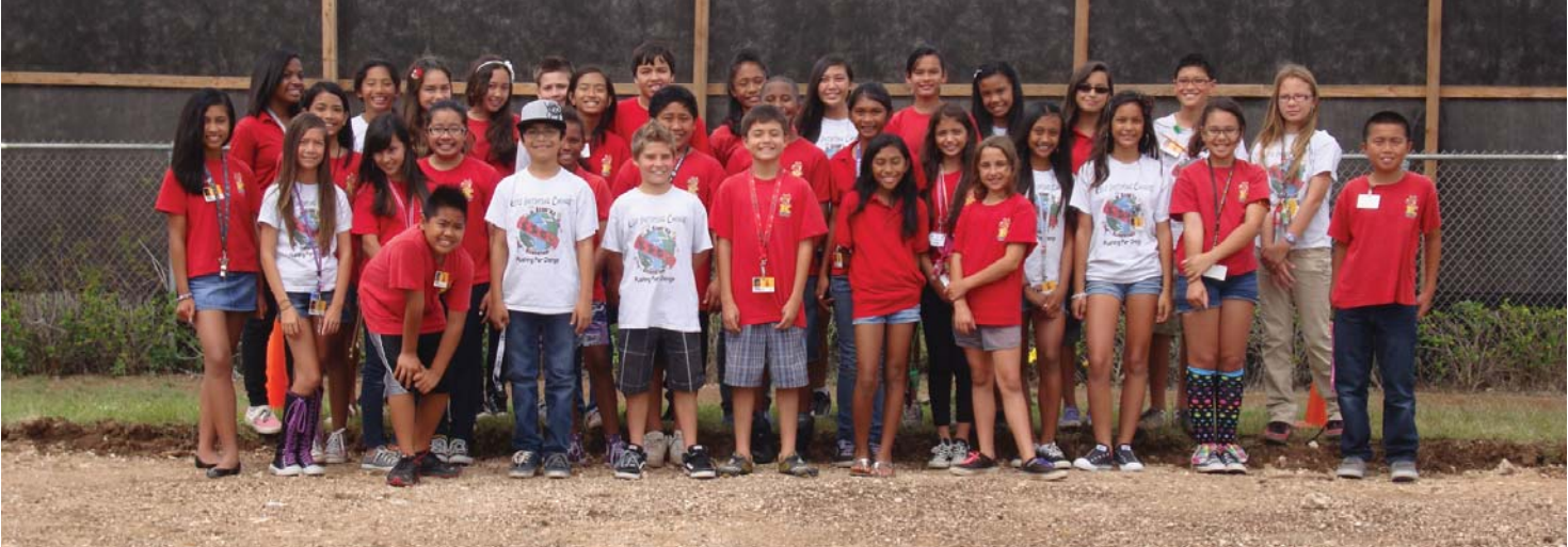
Keone'ula' Elementary School's Kids Initiating Change (KIC) service learning club